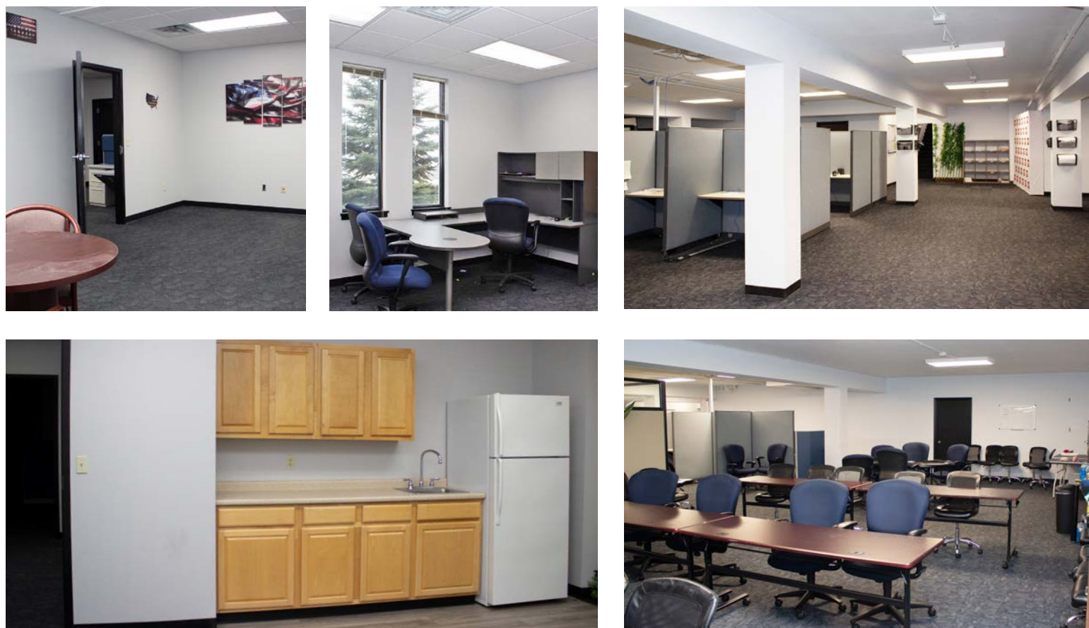
First Floor Suite 400